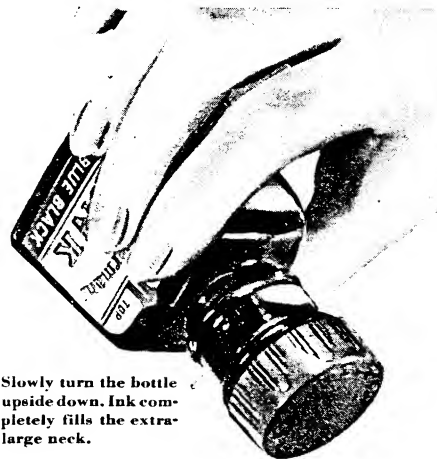
Slowly turn the bottle upside down. Ink completely fills the extra-large neck.

When you sell a Well-Top bottle of ink you are not only selling your customer a unique convenience in a container of excellent ink—but inasmuch as Well-Top allows him to use the very last drop of ink in the bottle, he also effects a marked economy by securing more “usable” ink.